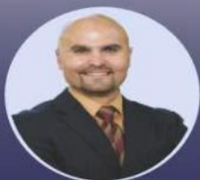
Catholic Answers Apologist & Author