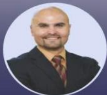
Catholic Answers Apologist & Author